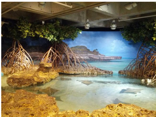
Figure 4: The Touch Tank at the New England Aquarium, Boston MA

One of the New England Aquarium's most popular exhibits is the Shark and Ray Touch Tank, where guests can pet small sharks and stingrays. The space has a naturally high background noise level due to the tank's pumps and the electric dryers for guests to use after washing their hands. When combined with the added noise of as many as 100 excited elementary school students, the hall containing the Touch Tank can be extremely loud. The New England Aquarium was interested in ascertaining the noise impact on the animals in the tank, as well as exploring potential room treatments to reduce the overall noise level for the comfort of their staff and guests.