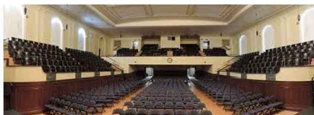
Figure 3: Battin Hall, Cary Memorial Building, Lexington, MA USA

To demonstrate the predicted effects of our various design recommendations, and to help the client prioritize their use of limited funds, we created and presented an auralization. This auralization included a natural sound source on the stage, the HVAC background noise, the full existing sound system (12 sources), the full proposed sound system (21 sources), and room responses with and without acoustically absorptive curtains. Several options were included for HVAC noise. The current noise was presented based on the system noise level and spectrum measured in the auditorium, and two proposed upgrades to the HVAC system were presented based on levels and spectra calculated according to ASHRAE guidelines. Since the auralization is being processed in real time, the background noise, PA system, and curtains can be toggled during playback with a continuously running source. This allowed for seamless comparisons between the different options and made the differences much easier for the clients to understand.