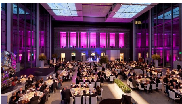
Figure 1: The Ruth and Carl J. Shapiro Family Courtyard at the Museum of Fine Arts Boston, MA USA.

The Ruth and Carl J. Shapiro Family Courtyard opened in 2010, and the response from the museum and the public has been overwhelmingly positive. The courtyard performs acoustically as