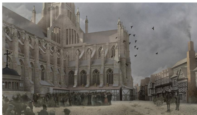
Figure 6: A rendering of Paul's Cross, outside of St. Paul's Cathedral, London, UK

The Virtual Paul's Cross auralization has facilitated a new level of conversation and inquiry into Donne's preaching and more broadly of the experience of the churchgoing public of 17th century England. We have been able to provide a direct experience of the way an unamplified voice interacts with an outdoor forum such as the historical Paul's Yard and of how speech intelligibility and loudness change for many listener positions and crowd sizes. Being able to switch between listener positions and crowd sizes immediately and in real time allows for much easier and more natural comparisons to be drawn from the auralization than would be possible from tabular data and opens the experience up to a wide range of interested listeners who lack the acoustical knowledge to gain a meaningful understanding of aural events from technical descriptions of them.