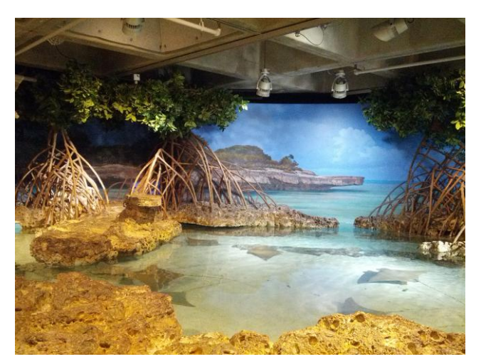
Figure 4: The Touch Tank at the New England Aquarium, Boston MA

One of the New England Aquarium's most popular exhibits is the Shark and Ray Touch Tank, where guests can pet small sharks and stingrays. The space has a naturally high background noise level due to the tank's pumps and the electric dryers for guests to use after washing their hands. When combined with the added noise of as many as 100 excited elementary school students, the hall containing the Touch Tank can be extremely loud. The New England Aquarium was interested in ascertaining the noise impact on the animals in the tank, as well as exploring potential room treatments to reduce the overall noise level for the comfort of their staff and guests.