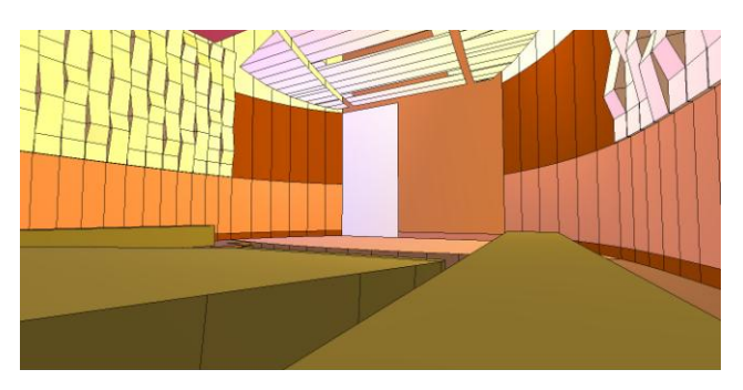
Figure 2: CATT Acoustic model of the University of Massachusetts recital hall, Boston, MA, USA

The new General Academic Building at the University of Massachusetts Boston, currently in design, will include a 400-seat music recital hall to be used for solo recitals, chamber music, jazz combos, orchestra, vocal chorus, and other musical ensembles. The design includes acoustical variability in the form of curtains at the lower walls. An auralization presented several different types of performance, including solo piano, jazz band, symphony orchestra, and vocal chorus, heard at three audience positions, with various curtain configurations. For the large ensembles, two source locations were included on stage to provide some left-right spatial spread. Stereo anechoic material was used where available, and in other cases monaural material was used. The source material was taken from the Denon compact disc "Anechoic Orchestral Music Recording" (1995) and from Wenger Corporation's "Anechoic Choral Recordings" (2004). The auralization helped the university music faculty to gain confidence in the design, particularly its acoustical variability.