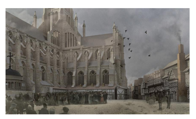
Figure 6: A rendering of Paul's Cross, ouside of St. Paul's Cathedral, London, UK

The Virtual Paul's Cross auralization has facilitated a new level of conversation and inquiry into Donne's preaching and more broadly of the experience of the churchgoing public of 17th century England. We have been able to provide a direct experience of the way an unamplified voice interacts with an outdoor forum such as the historical Paul's Yard and of how speech intelligibility and loudness change for many listener positions and crowd sizes. Being able to switch between listener positions and crowd sizes immediately and in real time allows for much easier and more natural comparisons to be drawn from the auralization than would be possible from tabular data and opens the experience up to a wide range of interested listeners who lack the acoustical knowledge to gain a meaningful understanding of aural events from technical descriptions of them.