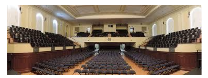
Figure 3: Battin Hall, Cary Memorial Building, Lexington, MA USA

To demonstrate the predicted effects of our various design recommendations, and to help the client prioritize their use of limited funds, we created and presented an auralization. This auralization included a natural sound source on the stage, the HVAC background noise, the full existing sound system (12 sources), the full proposed sound system (21 sources), and room responses with and without acoustically absorptive curtains. Several options were included for HVAC noise. The current noise was presented based on the system noise level and spectrum measured in the auditorium, and two proposed upgrades to the HVAC system were presented based on levels and spectra calculated according to ASHRAE guidelines. Since the auralization is being processed in real time, the background noise, PA system, and curtains can be toggled during playback with a continuously running source. This allowed for seamless comparisons between the different options and made the differences much easier for the clients to understand.