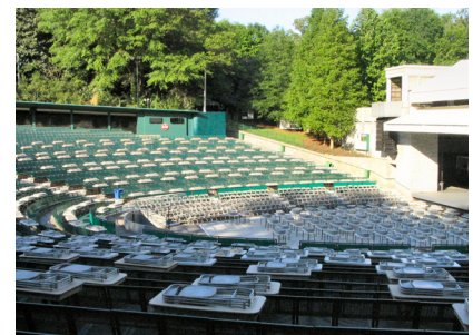
View of venue.

O:\marketing\project summaries\arena stadiums\Chastain.pmd