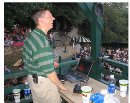
Monitoring sound levels during a performance.