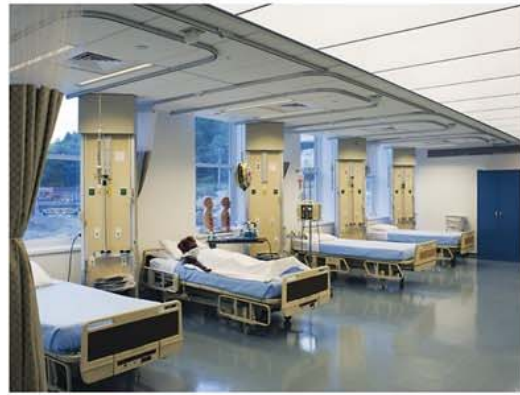
ABOVE Acoustical ceiling panels help reduce noise buildup in this open simulation room at the University of Massachusetts at Amherst's Skinner Nursing School, which was renovated by Anshen + Allen, Boston.

al balancing dampers should be remotely located from diffusers and registers to reduce the level of damper noise transmitted to these air terminal devices. Diffusers and registers usually have noise criteria (NC) ratings based on ideal flow conditions as measured in a laboratory. The effective noise levels of these air devices may increase with unfavorable flow conditions. Airflow velocities at diffusers and registers should