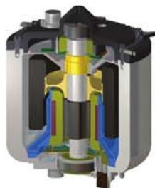
Carbon fiber flywheel

The Pentadyne energy storage system is vastly more reliable and cost efficient. Just one flywheel eliminates 32,000 lbs of lead and sulfuric acid from your facility and that "cross-your-fingers" approach to power certainty. It connects just like a battery cabinet – but without the dangers,